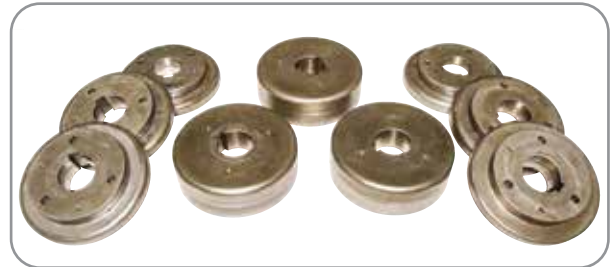
Universal Tooling Set Included for Multiple Profiles