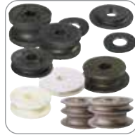
Pipe & Tube Tooling