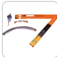
Radius & Degree Measuring Kit