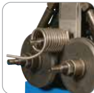
Small Radius Tooling