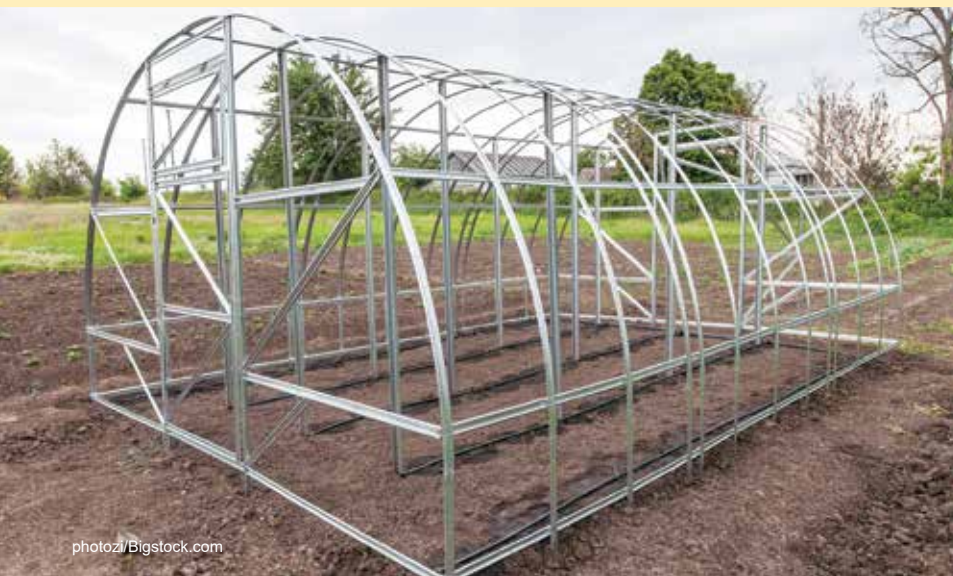
◀ Ercolina Bending Application

Product Demonstrations Available on Website