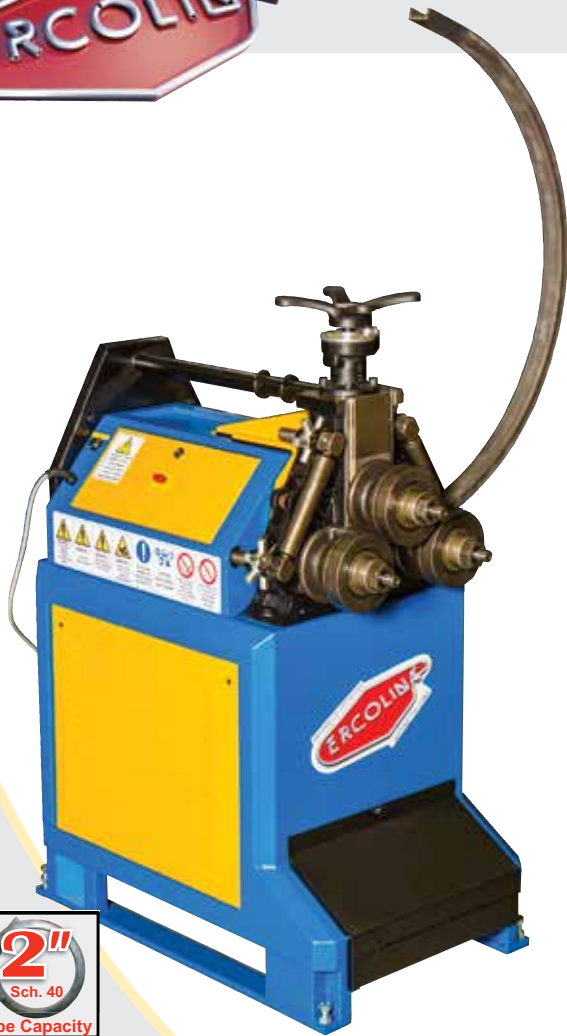
Vertical or Horizontal Operating Position