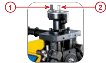
Two-Speed Gear Box