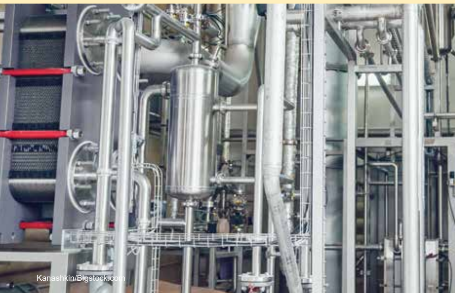
◀ Ercolina Bending Application

Product Demonstrations Available on Website