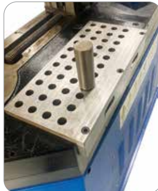
Part# FP500P1-TB80 For use on TB80 model.