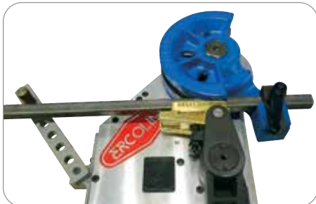
Part# FP500P1-A For use on 030 Mega Bender, TB60, SB48 and 48 Plus models.

Extractor plate assists in square material extraction for profiles, solid and hollow.