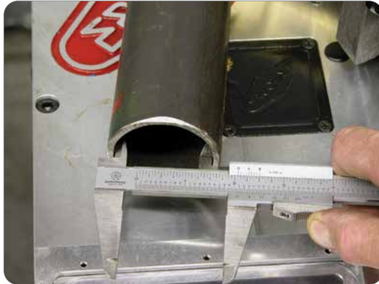
Pipe dimensions are based on I.D. of material (2" sch. 40 pipe measures 2.375" O.D.).