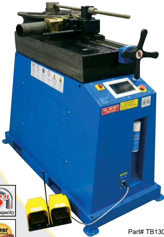
Part# TB130 machine only