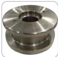
Roller Counterbending Die