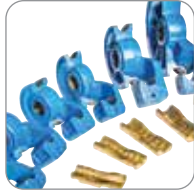
Tube & Pipe Tooling Kits