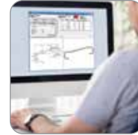
Easy Part Layout Software