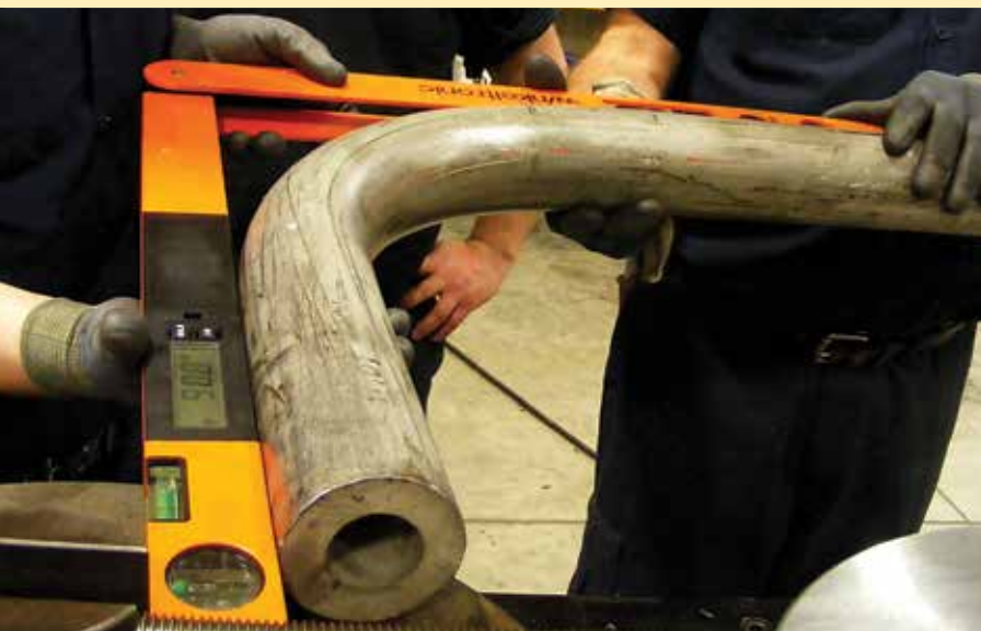
◀ Ercolina Bending Application

Product Demonstrations Available on Website