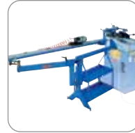
Two Axis Positioner