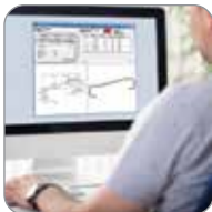
Easy Part Layout Software