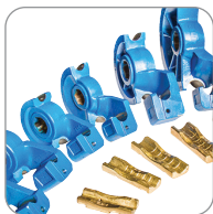
Tube & Pipe Tooling Kits