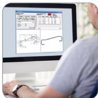
Easy Part Layout Software