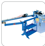
Two Axis Positioner