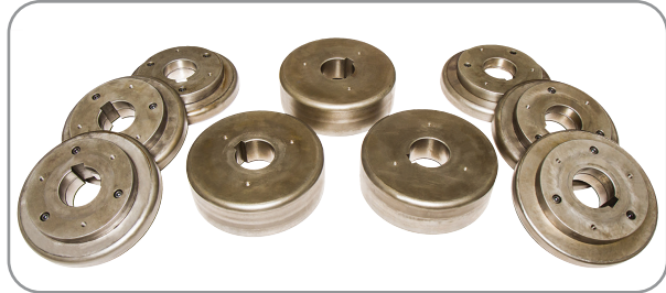
Universal Tooling Set Included for Multiple Profiles

Vertical or Horizontal Operating Position