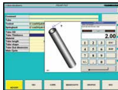
STORE MATERIAL INFORMATION

Interactive CNC Control Available on these Models: