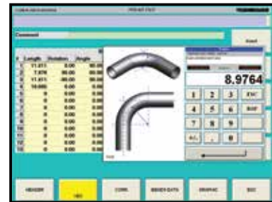
BEND ANGLE & SPRINGBACK