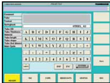
TOUCH SCREEN PROGRAMMING