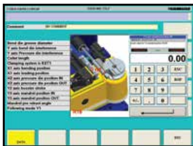
STORE ALL TOOL SET INFORMATION