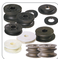
Pipe & Tube Tooling