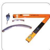
Radius & Degree Measuring Kit