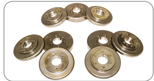
Universal Tooling Set Included for Multiple Profiles