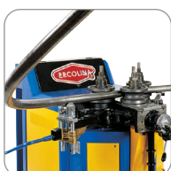
Large Spiral Accessory