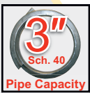
CE70H3-RLI w/Hydraulic 3 Axis Twist