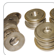
Modular Tooling Set