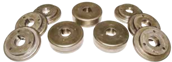
Universal tooling set in Polymer available: CE40 (C4STPOLY) and CE50 (C5STPOLY)