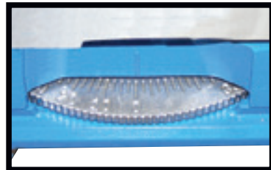
Degree wheel for repeatable bending angles

* Contact CML USA for complete technical specifications. All capacities based on mild grade materials; heavy wall and high tensile materials reduce machine capacity.