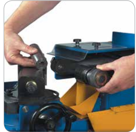
Patented quick-change roller system