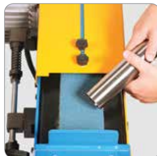
Top Deburring Surface

Product Demonstrations Available on Website