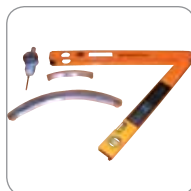
Radius & Degree Measuring Kit