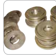
Modular Tooling Set