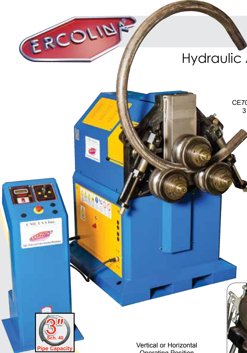
CE70H3 w/Manual 3 Axis Twist