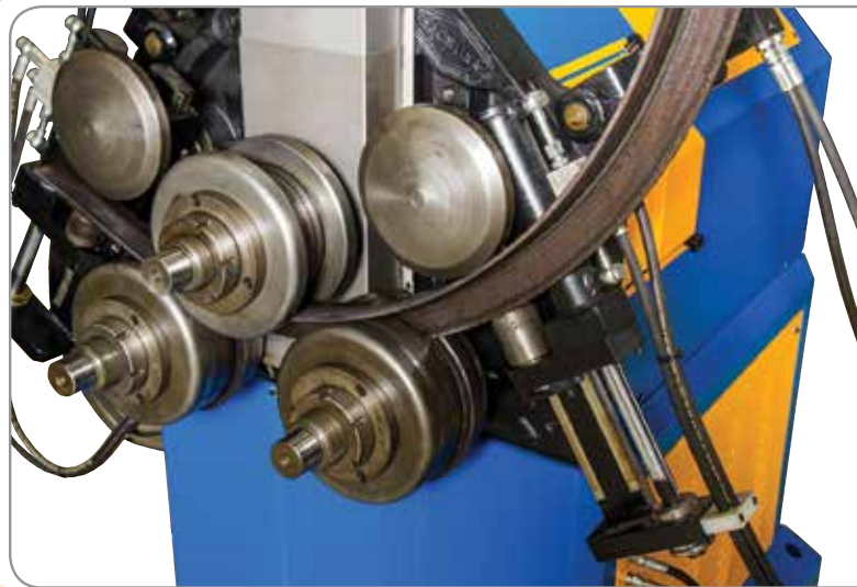
CE70H3-RLI w/Hydraulic 3 Axis Twist

Vertical or Horizontal Operating Position