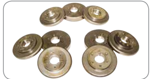
Universal Tooling Set Included for Multiple Profiles