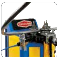
Large Spiral Accessory